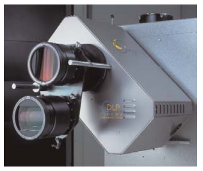
Unique, dust-proof digital head with twin anamorphic lens attachment

Electronic masking left, right, top and bottom. Independent left and right keystone correction. Correction of keystone distortion in up to 15% down or side angle